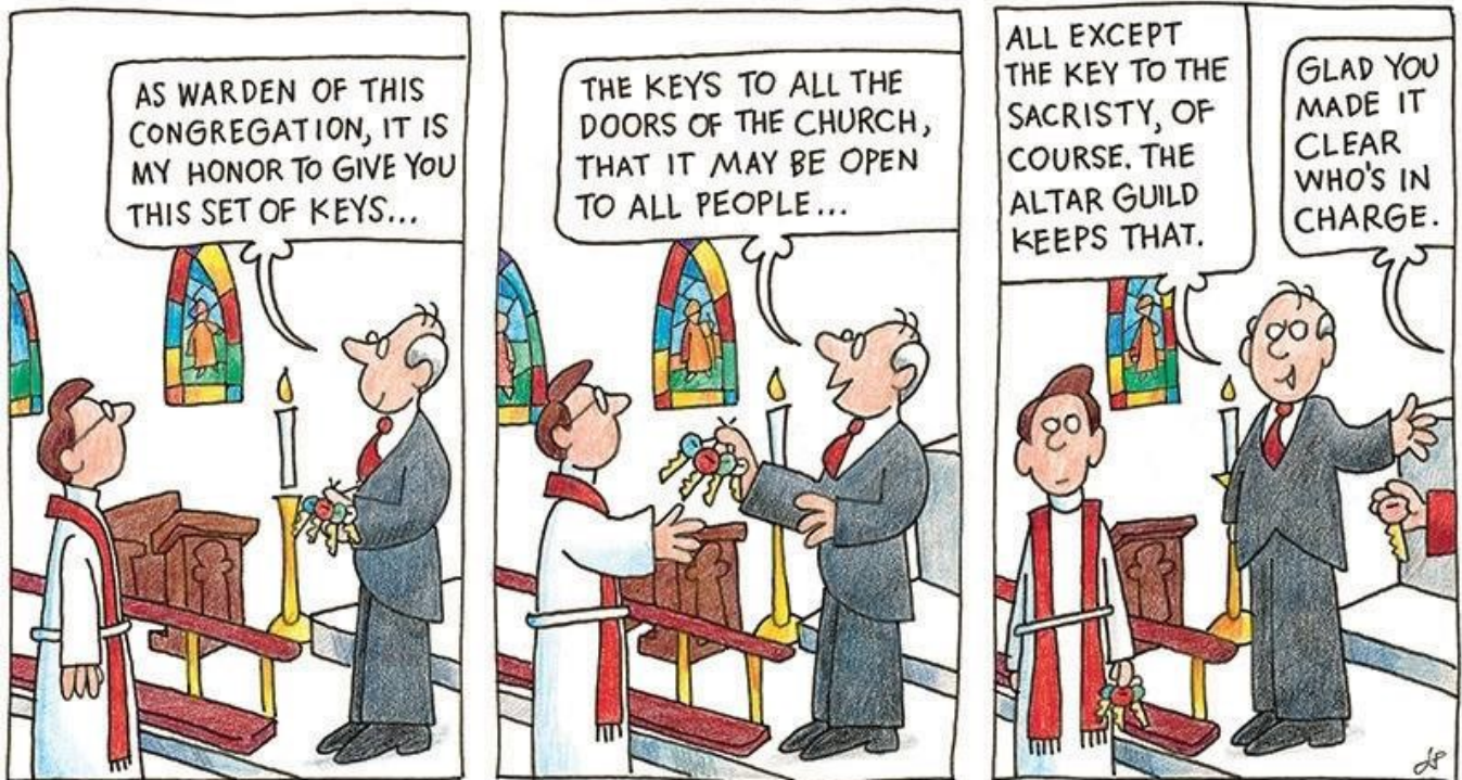
AT THE INSTALLATION OF THE NEW RECTOR.